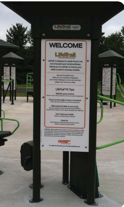
Functional fitness opportunities for adults 50 and over.

Questions? Need additional information? Give us a call at 215-348-9915 and we'll be glad to assist you.